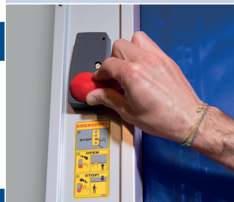
Odpiranje v sili

V nujnih primerih lahko rdeči ročaj obrnete, da sprostite protiutež in odprete vrata.